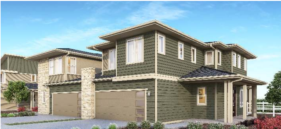
*This is an artist rendering and color/elevation may change per building. See Sales Associate for more information.