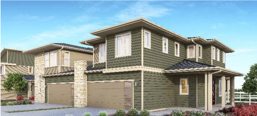
*This is an artist rendering and color/elevation may change per building. See Sales Associate for more information.