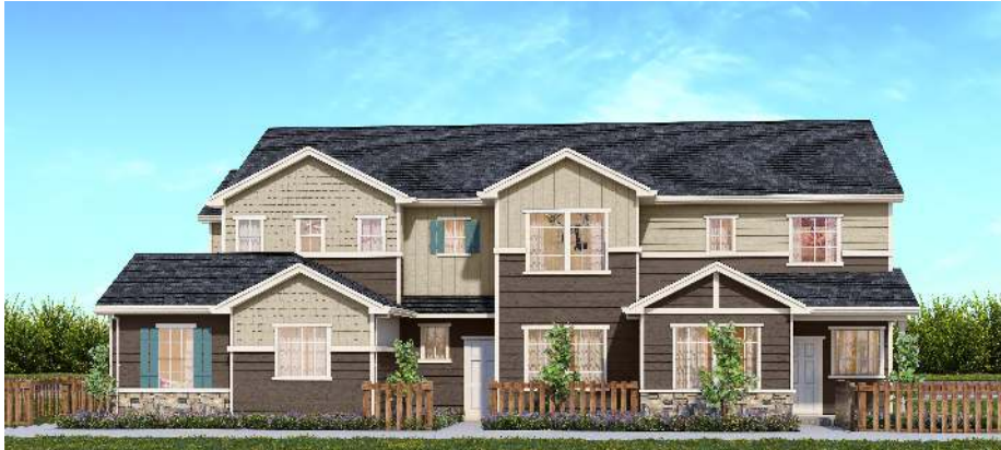
*This is an artist rendering and color/elevation may change per building. See Sales Associate for more information.