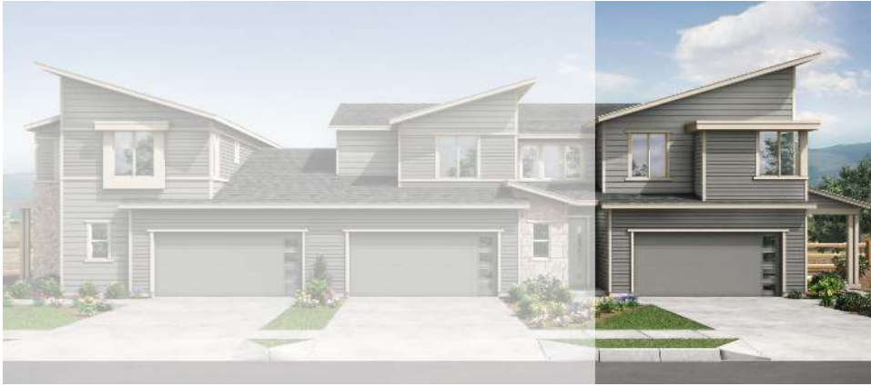
*This is an artist rendering and color/elevation may change per building. See Sales Associate for more information.