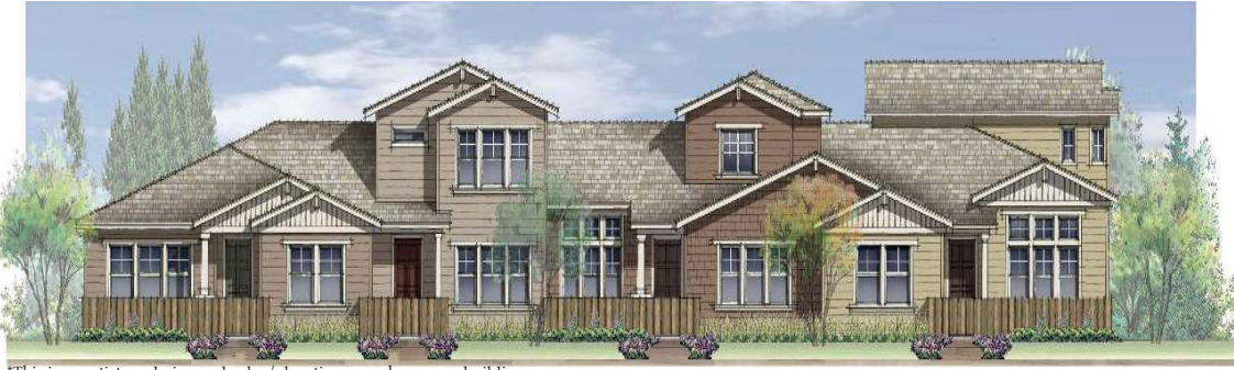
*This is an artist rendering and color/elevation may change per building