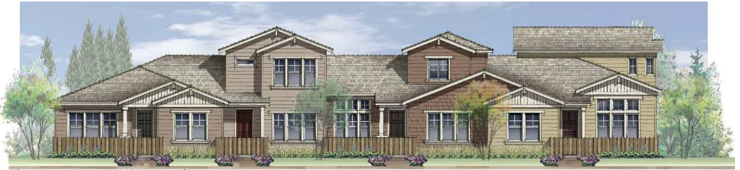
*This is an artist rendering and color/elevation may change per building